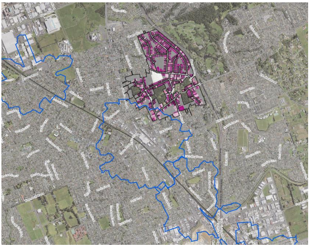
Figure 1: The blue line is the walkable catchment of the Manurewa Train station