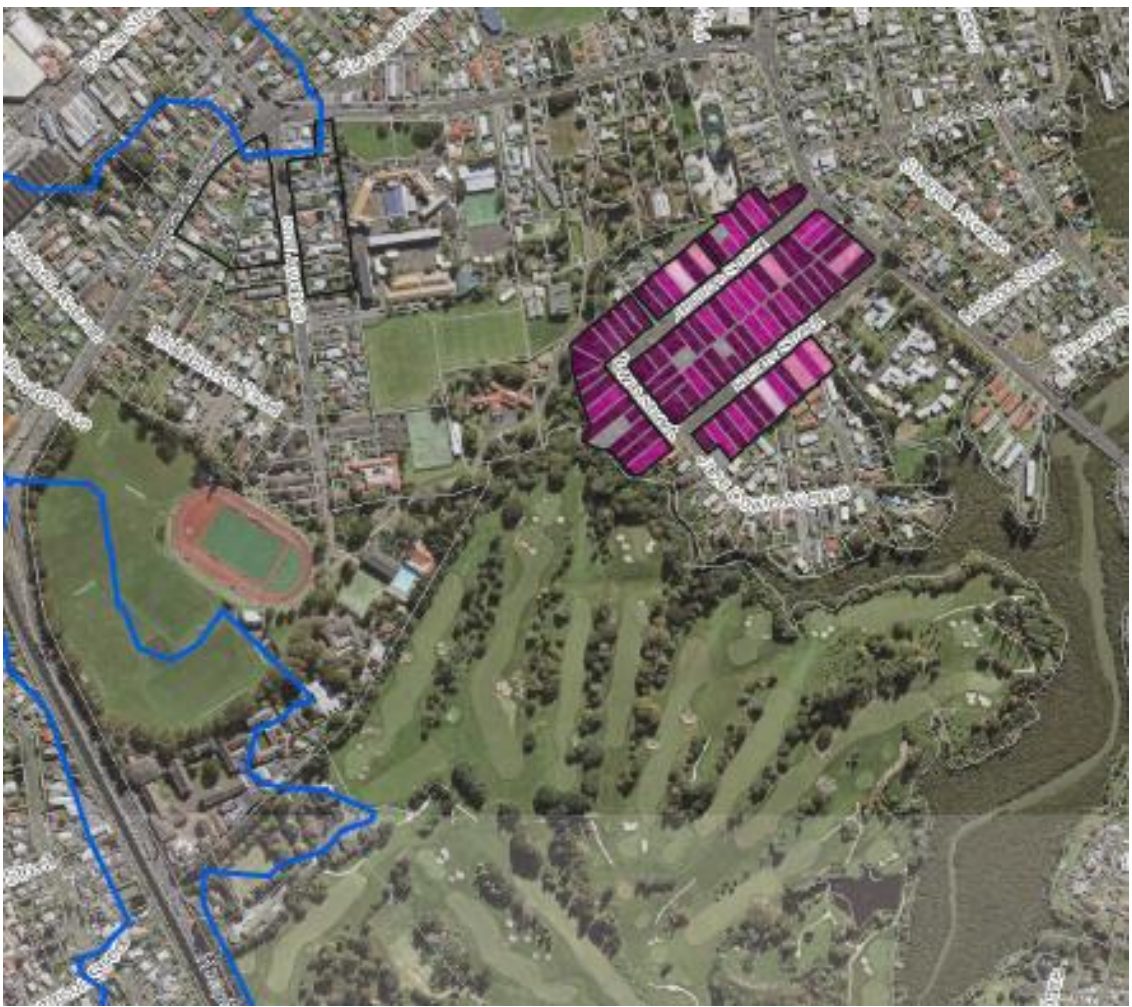
Figure 1: The blue lines are the walkable catchments of Ōtāhuhu Train Station and Middlemore Train Station