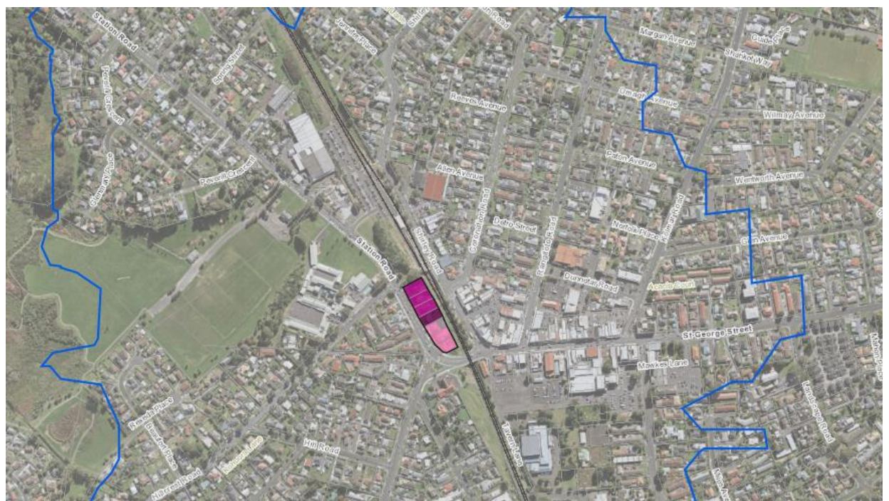
Figure 1: The blue line is the walkable catchment of the Papatoetoe Train Station