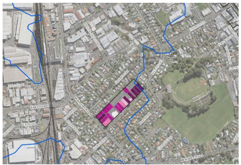
Figure 1: The blue line is the walkable catchment of the Ōtāhuhu Train Station