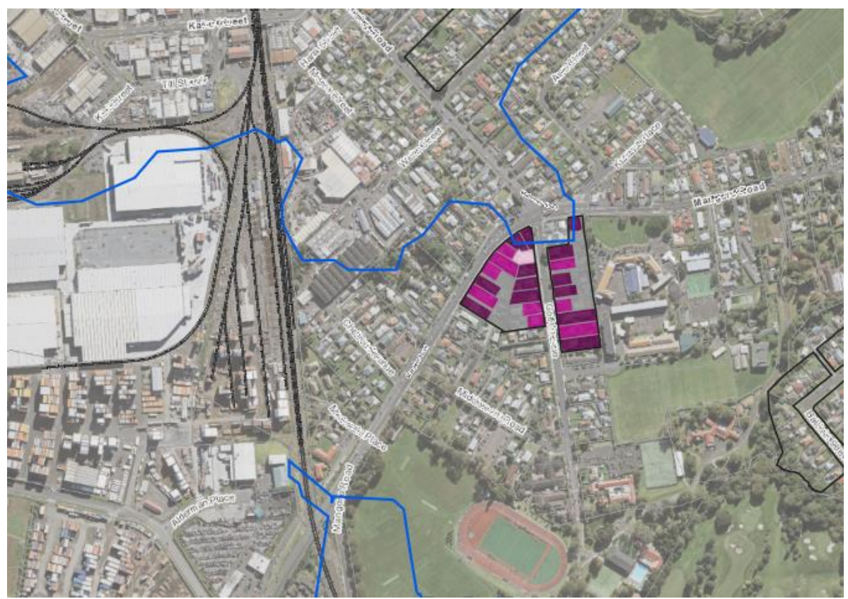
Figure 1: The blue line is the walkable catchment of the Ōtāhuhu Train Station